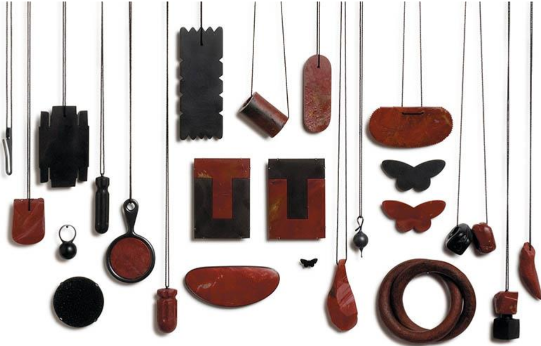
Warwick Freeman A Different Black , 2013 Various materials

This pack is designed to support teachers and educators in planning a visit to the exhibition with suggested ideas, workshops and points for discussion. It focuses on drawing as a means of exploring the works and thinking about artists' practice. The activities are suitable for all ages and can be adapted to your needs before, during and following your visit.