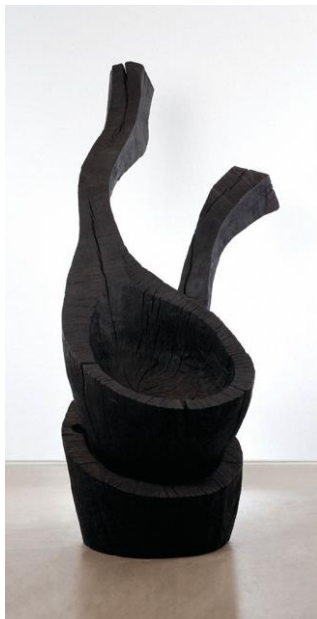
David Nash Two Falling Spoons , 1994 Carved, charred oak 1900mm

http://www.kew.org/web-image/KPPCONT_060535?gallery=Ash-Dome-through-the-seasons